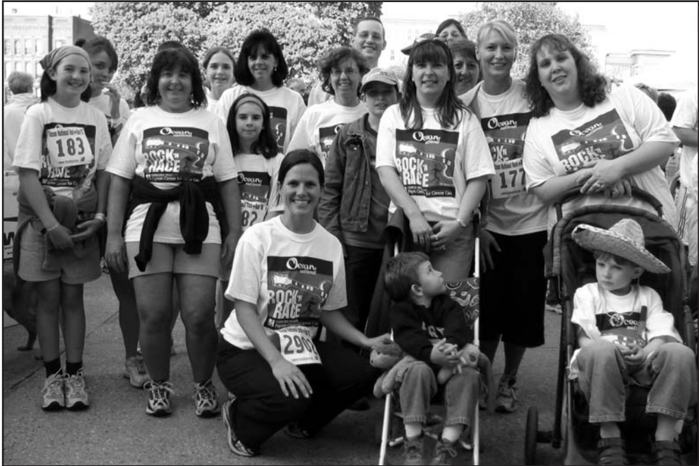
CRVNA staff & family take part in the “Rock ‘n Race” to benefit the Payson Center for Cancer Care

Volunteers in Hospice Services, Community Health Services, Home Care, and volunteer Trustees on the Board gave more than 7,915 hours of service.