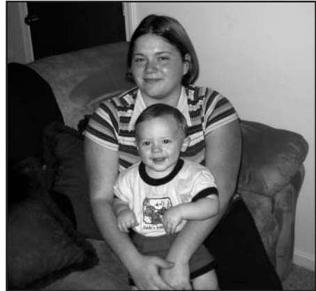
This mom and toddler are helped by a home visitor's support and encouragement in the CRVNA Parent Friend Program.

The CRVNA Parent Friend Program provides support and mentoring for parents who are struggling with the demands of providing care and a nurturing home environment for their infants and children. There is no fee to participate in the Parent Friend Program. Home Visitors are trained to work one-on-one with parents in their homes. Weekly home visits include instruction in the physical care of infants and children, child development, nutrition, smoking cessation, household management, budgeting, and goal setting. Parents are referred to CRVNA by physicians, social service agencies, schools, and CRVNA's "Baby's First Homecoming" nurses. The Parent Friend Program served 56 families with 99 children. More than 1,000 goals were achieved by the parents, such as developing budgeting skills, obtaining better housing, smoking cessation, completing a GED program, enrolling children in Head Start, obtaining a driver's license, and securing child support.